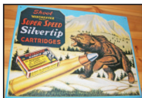
Wide Variety of Art work and prints.