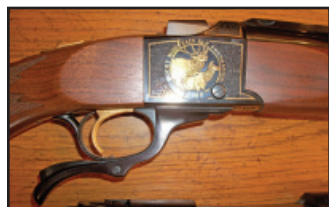
Ruger #1 Rocky Mountain Elk Foundation 1998 gun of the year .270 Weatherby Mag number 156/400 ser# 133-45893 comes with presentation case.