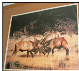
King of the Hill.