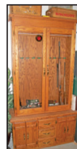
10 gun custom gun cabinet.