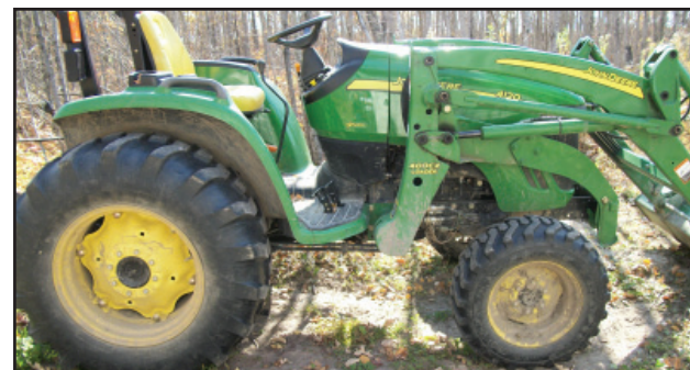
Like new John Deere 4120 tractor 2006 mod year, 600 hours, 43 1/2 hp, front wheel assist., ROPS, hydro static, hydraulics, 3point 540 pto, w/ 400 CX self leveling bucket.