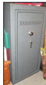
Freedom gun safe holds 10.

Many fine top quality firearms, some NIB, to include, Hi Std A102 .22 semi auto (needs firing pin); RMEF CVA 50 cal percussion-Savage 110 22-250 w/ Burris fullfield 6X18 scope; Savage 93R17 17 HMR w/ Simmons prohunter 4X12 scope Ruger 77 MKII 7mm Rem Mag w/Leupold VX III 3.5X10; Ruger Redhawk 7 1/2" Stainless .44 Mag w/shoulder holster; TC Contender w/ 2 10" brlrs bothe .44 Mag/410, one ribbed one sighted w/ muzzle brake; Cti 12ga O/U Ruger M77 Bicentennial issue .257 Roberts w/2X7 Leupold; Ruger M77 .257 Roberts tang safety heavy barrel w/Safari sights and Leupold VariXIII 1.5X5; Browning BLR81 .243 Xtra Clip w/Leupold 2X7; Winchester push feed M70 synthetic stock 30-06 NIB; CVA percussion half stock .50cal.