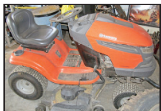
Husquavarna YTH2348 23hp 48" cut 2006 mod year riding mower.