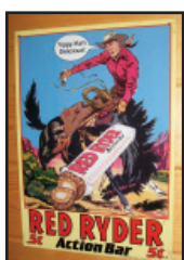
Wide Variety of Art work and prints.