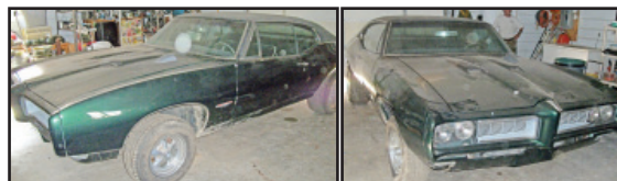
68 Pontiac GTO, 90K, 400 Muncie 4spd, Cragers, hood mounted tach, like new rubber, comes with spare rear end.