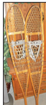
10x56 Alaskans w/leather bindings.